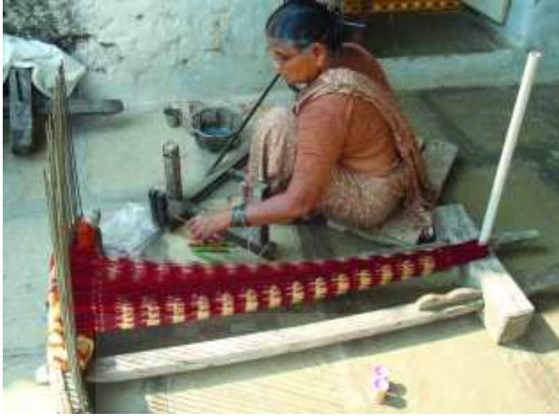
Fig 9.6 Bobbin winding