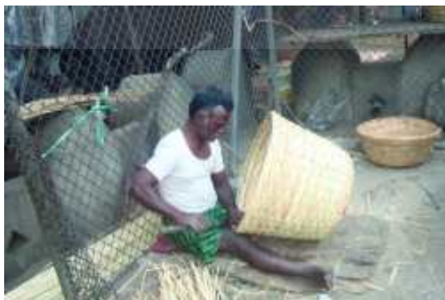
Fig 9.3 Basket weaving

People of Yerukula tribe are usually involved in basket making and live in different parts of Andhra Pradesh. They are called ' Yerukula ' after their women's