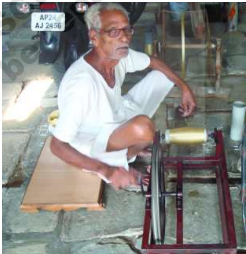
Fig 9.5 Winding thread