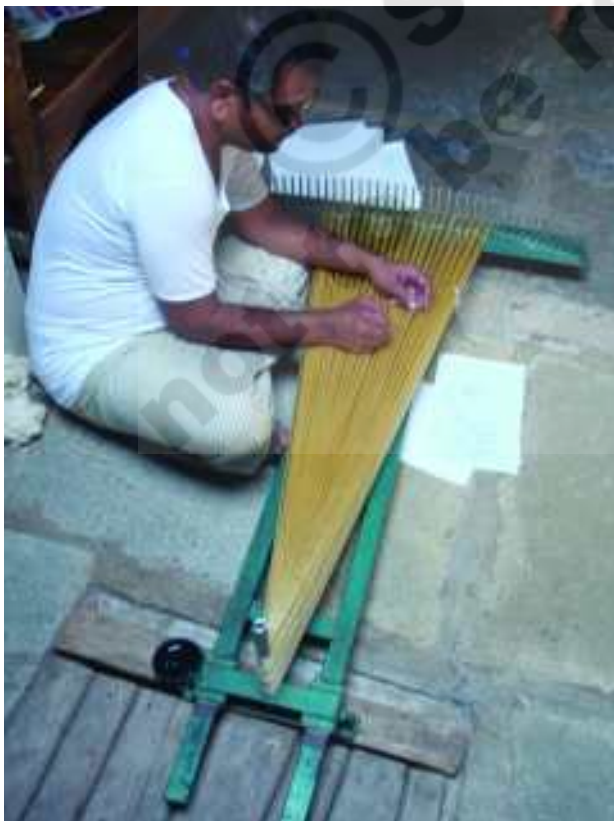
Fig 9.7 Marking design