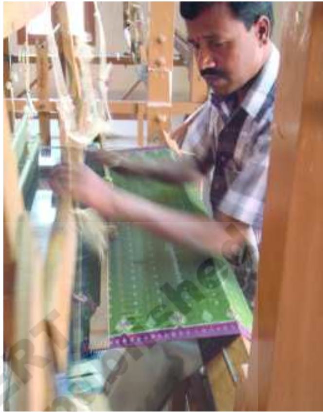
Fig 9.8 Weaving in process

The buyers are spread all over the world and weavers do not have any direct contact with them. Fashions in the cities change fast and it is difficult for the weavers to know what kind of designs are in demand and they have to rely on middle men to know about the designs in vogue and change their designs accordingly. They have to depend on middlemen for getting raw materials like cotton or silk yarn as these are produced in far