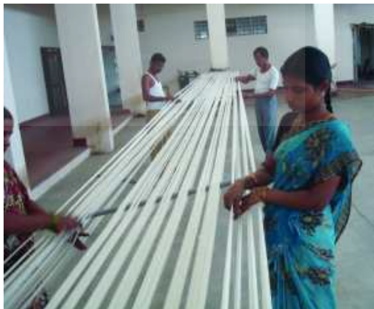
Fig 9.9 Warping

away centres. This gives the middlemen an important position in the handloom industry and they try to get the largest share of the price paid by the buyers of the sarees.