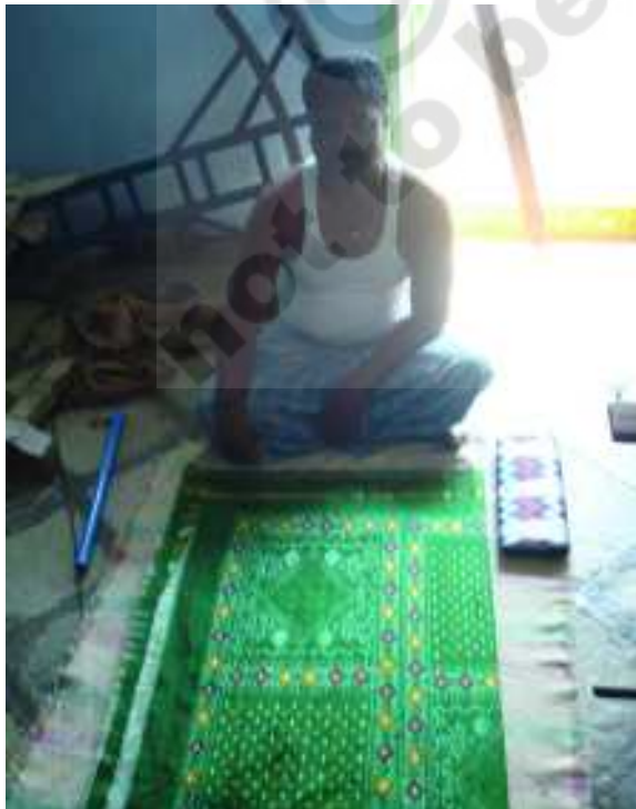
Fig 9.10 Folding the Ikkath Saree

However, now-a-days, a large section of weavers in many other parts of Andhra Pradesh also do not get sufficient work from cooperative societies. In some cooperative societies, weavers are not given any role in decisions regarding procurement of raw materials and sale of cloth materials. They do not provide opportunities for weavers to produce sarees to suit the changing preferences of consumers. This has once again pushed the weavers into the clutches of the middlemen and traders.