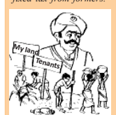
Zamindar rented land to the tenants.