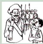
Zamindar gets more power can collect more money