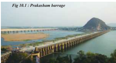
Fig 10.1 : Prakasham barrage

got the lands cultivated by others. Under this settlement the peasants cultivating the land were identified, their field was identified and a survey number was given to every piece of land fixing the legal ownership. The yield, price situation, market conditions and the crop cultivated was taken into account to decide the tax per acre. But before the cultivation commenced in 1801-02, Munro made necessary advances to the ryots to purchase seeds, implements, bullocks and to repair old wells or dig new ones. He argued that the British government should act as a father figure protecting the ryots. This proved very effective and that year saw a bumper crop and very good revenue collection. This confirmed that Munro's approach was right.