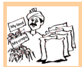
Under Ryotwari system, I produced more crop.

Ryot means a cultivator. The ryotwari means peasant tenure. It was decided to collect revenue from the actual cultivators/owners of the land who either worked on the land themselves or