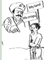
Zamindar decides what the peasant cultivates and the tax to be paid