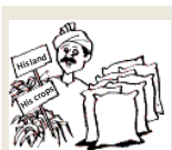
Pay more tax, Land is not cared for. If I don't produce as much as the Zamindar demands I have to vacate the land

After two decades of debate on the question, the Company finally introduced the Permanent Settlement in 1793 when Cornwallis was the Governor General. By the terms of the settlement, zamindars were given the powers to collect the revenues agreed upon in auctions. Therefore it was also called zamindari settlement. They have to pass on 90% of the amount to the Government retaining 10% as collection charges. The amount to be paid was fixed permanently, that is, it was not to be increased in future. It was felt that this would ensure a regular flow of revenue into the Company and at the same time encourage the zamindars to invest in improving the land. Since the revenue demand of the state would not be increased, the zamindar would benefit from increased production from the land. The Zamindars however collected more revenue than agreed upon through auction. They continuously increased the revenue and changed the cultivators who did not meet the demand. This settlement inadvertently converted all the peasants into the tenants, and the zamindars collected rent rather