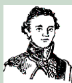
Company collects tax from Zamindar