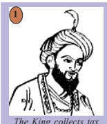
The King collects tax from Zamindar