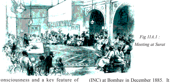
Fig 11A.1 : Meeting at Surat

consciousness and a key feature of nationalism. In other words, they believed that the Indian people should be empowered to take decisions regarding their affairs. Many of these intellectuals also led campaigns against some British policies like taxes on textiles, racial discrimination against Indians, repressive laws against Indian newspapers etc. They realised the importance of discussing the policies of the government and organising campaigns to change them