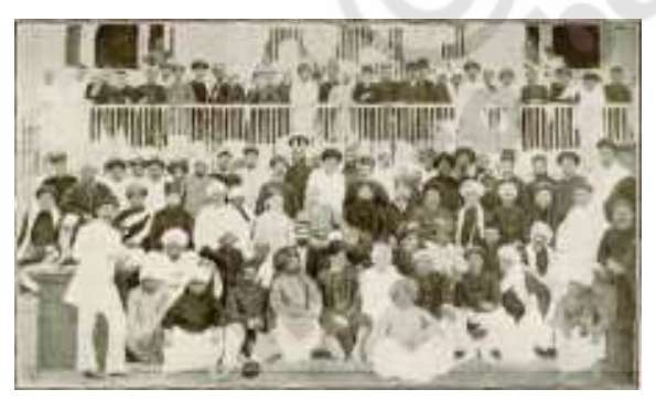
Fig 11A.2 : Delegates of the First Indian National Congress meeting, 1885

National Movement - The Early Phase 1885-1919