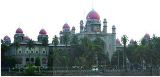
Fig 15.1 : A.P. High Court