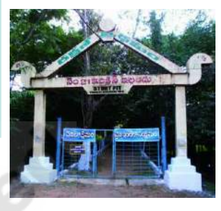
Fig 6.4: No. 21 Incline, entrance to the mine

We boarded a bus to Kothagudem from Hyderabad bus stand. On reaching Kothagudem we visited the office of SCCL and took permission to visit the mines. We then travelled 40 Km from Kothagudem to Yellandu. Here again we went to the office of SCCL and took permission to go down the No.21 Incline.