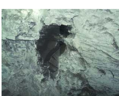
Fig 6.7: Dolomite painted coal wall

Now we were approaching to the coal drilling area or 'face'. Every day the supervisors inspect the coal seam and give instructions for that day's mining – where the mining is to be done, and what safety measures had to be taken. Different groups of people are assigned different tasks. One group was drilling holes with pneumatic air compressor to plant the explosive rods. Resin packets were