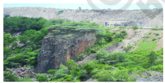
YSR Kadapa District

on an equal amount of land where it has lopped off the jungles. It will pay Rs. 4.38 to Rs. 10.43 lakh per hectare, he said. The local people also complained that due to these mines which dig up the earth and create huge artificial hills of loose earth, rivers and streams are getting choked and ground water is getting polluted and there is acute scarcity of even drinking