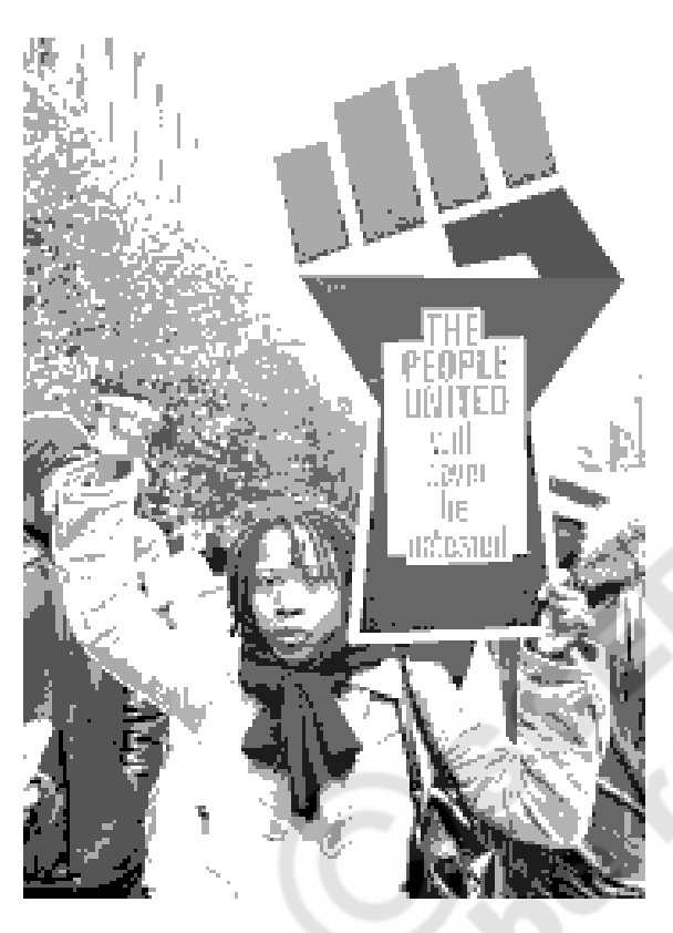
Fig. 19.1: Peoples protest

In an earlier chapter you read about the democratic revolutions which established democratic forms of government in Europe. Establishing forms of government which are in accordance with the wishes and requirements of the people, in which all people are able to participate freely and fully, in which all kinds of people find respectable space is a dream for which people are still striving for all over the world.