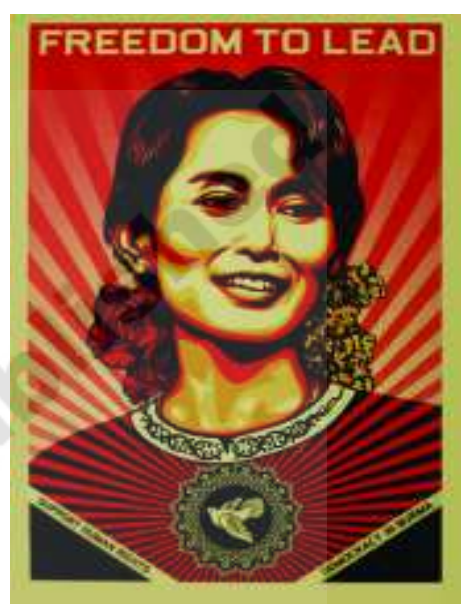
Aung San Suu Kyi: A poster from Myanmar supporting Democracy.

There is also international pressure created through economic sanctions. This disallows the trade between Burma and those countries. As a result Burma is not able to export its products or get necessary imports. This puts great pressure on the economy. Even though this ultimately harms the common people of that country, 'economic sanctions' are used to bring pressure on the rulers. Over the years there has been a worldwide pressure on the military government to extend civil liberty and usher in a democratic government.