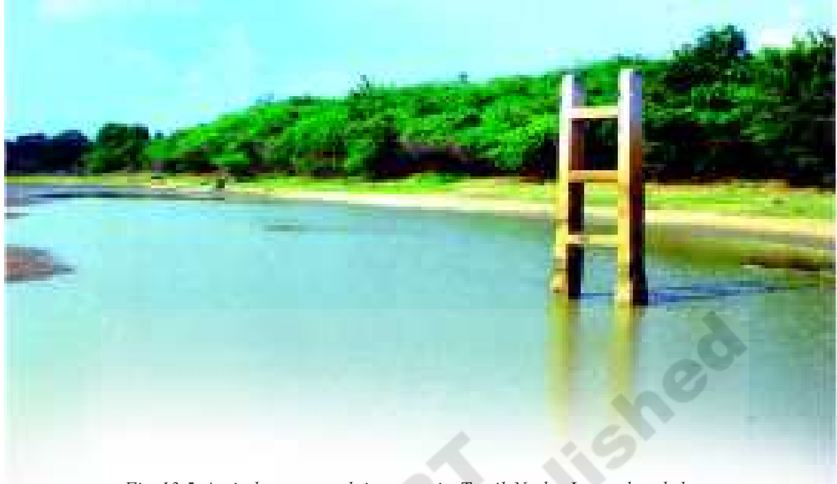
Fig 13.5 A ninth century sluice gate in Tamil Nadu. It regulated the outflow of water from a tank into the channels that irrigated the fields.

Although agriculture had developed earlier in other parts of Tamil Nadu, it was only from the fifth or sixth century that this area was opened up for large-scale cultivation. Forests had to be cleared in some regions; land had to be levelled in other areas. In the delta region embankments had to be built to prevent flooding and canals had to be constructed to carry water to the fields. In many areas two crops were grown in a year.