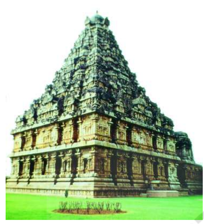
Fig 13.3 The temple at Gangaikonda-Cholapuram. Notice the way in which the roof tapers. Also look at the elaborate stone sculptures used to decorate the outer walls.

became king in 985 AD and expanded control over most of these areas. He also reorganised the administration of the empire. Rajaraja's son Rajendra I continued his policies and even raided the Ganga valley, Sri Lanka and countries of Southeast Asia, developing a navy for these expeditions.