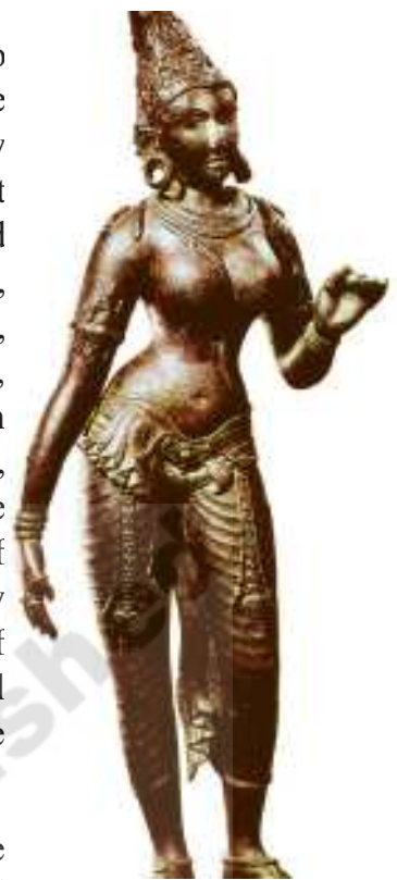
Fig 13.4 A Chola bronze sculpture. Notice how carefully it is decorated.

Amongst the crafts associated with temples, the making of bronze images was the most distinctive.