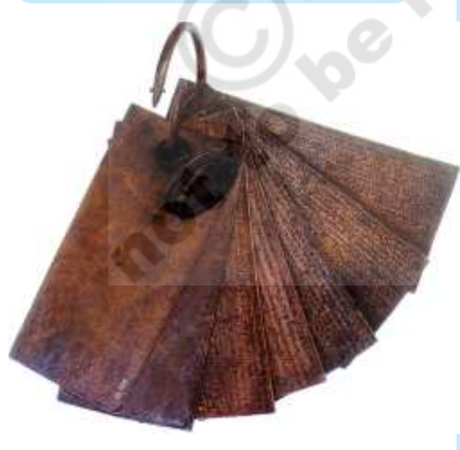
Fig 13.2 This is a set of copper plates recording a grant of land made by a ruler in the ninth century, written partly in Sanskrit and partly in Tamil. The ring holding the plates together is secured with the royal seal, to indicate that this is an authentic document.

Kings often rewarded Brahmanas by grants of land. These were recorded on copper plates, which were given to those who received the land.