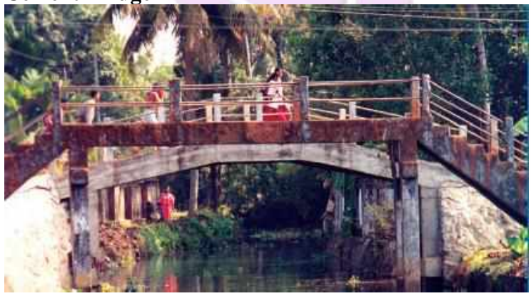
1. How is this bridge different from a bamboo bridge? Answer:

A cement bridge is made up of bricks, cements and iron rods. But a bamboo bridge is made of bamboo sticks, ropes and poles. Hence, a cement bridge is stronger than a bamboo bridge and more people can cross a cement bridge at a time.