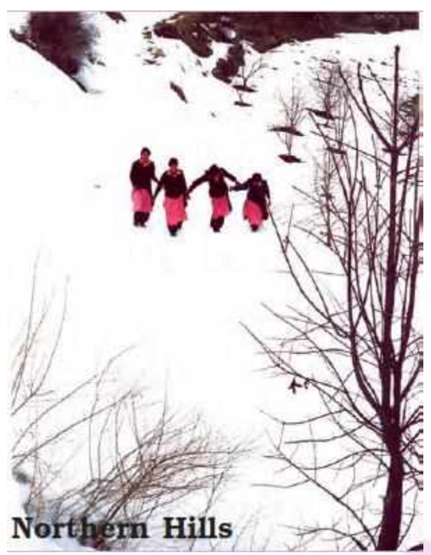
1. Have you ever seen so much snow? Where? In films or somewhere else? Solution:

Yes, I have seen so much snow during my tour to Jammu and Kashmir.