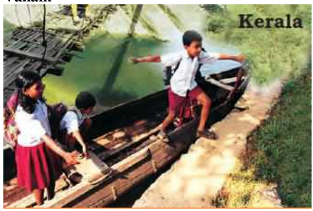
1. Have you seen any other kind of boats? Answer:

Yes, I have seen other kind of boats. Some of them are paddle boat, row boat, motor boat and house boat.