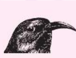
To suck nectar from flowers