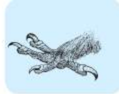
To catch the prey (what it hunts)