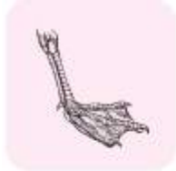
To swim in water