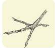
To hold the tree branches