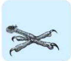
To climb the tree