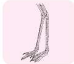
To walk on the land