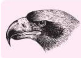
To tear and eat meat