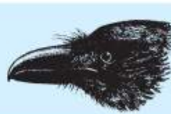
To cut and eat many kinds of food