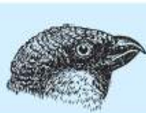
To break and crush seeds