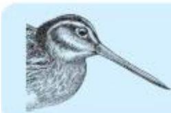
To find insects and worms from mud and shallow water