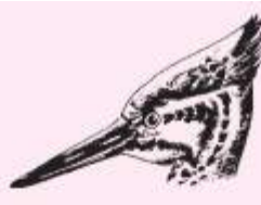
To make holes in wood and tree trunks