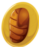
Cocoon with developing moth

7. Out of the following, which are the two terms related to silk production?