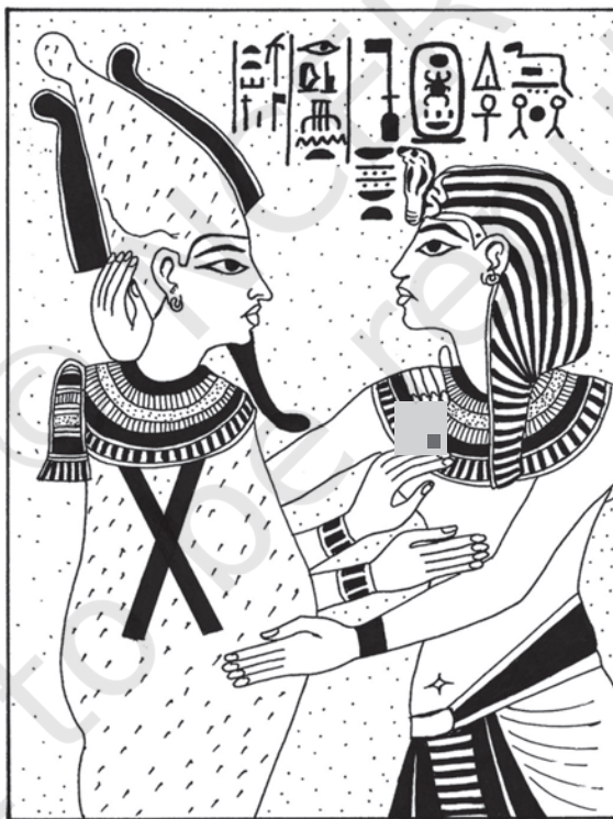
Mural in King Tut's tomb showing King Tut with Osiris, the god of the afterlife

Back in the trailer a technician pulled up astonishing images of Tut on a computer screen. A grey head took shape from a scattering of pixels, and the technician spun and tilted it in every direction. Neck vertebrae appeared as clearly as in an anatomy class. Other images revealed a hand, several views of the rib cage, and a transection of the skull. But for now the pressure was off. Sitting back in his chair, Zahi Hawass smiled, visibly relieved that nothing had gone seriously wrong. "I didn't sleep last night, not for a second," he said. "I was so worried. But now I think I will go and sleep."