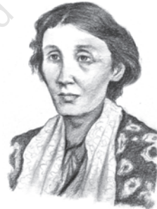
Virginia Woolf 1882-1941

This essay records fleeting impressions and delicate shades of mental experience.