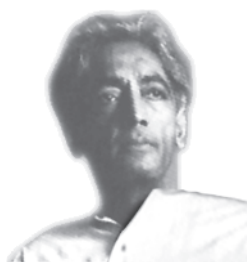
J. Krishnamurti 1895-1986

Jiddu Krishnamurti was a world renowned writer and speaker on fundamental philosophical and spiritual subjects such as the purpose of meditation, human relationships, and how to bring about positive change in global society. His supporters, working through several non-profit foundations, oversee a number of independent schools centred on his views on education, in India, England and the United States. His talks, group and individual discussions, and other writings are published in a variety of formats including print, audio-video as well as online, in many languages.