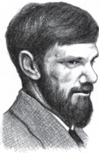
D.H. Lawrence 1885-1930

D.H. Lawrence was born in a coal-mining town. He was the son of an uneducated miner and an ambitious mother who was a teacher. His wife was German, and the couple lived, at various times, in Italy, Germany, Australia, Tahiti and Mexico.