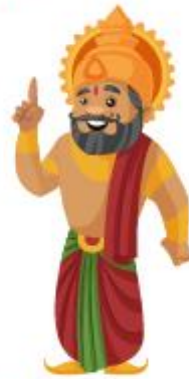
K is for King