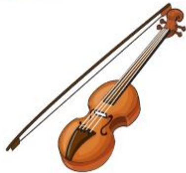
V is for Violin