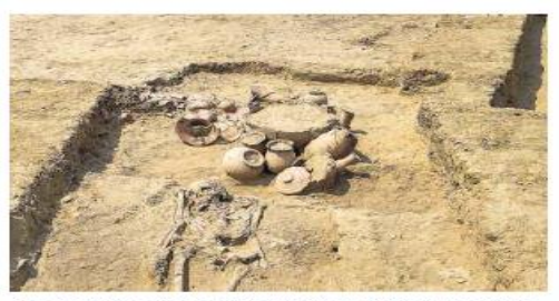
The excavation site at Rakhigarhi where 60 skeletons were found by the Archaeological Survey of India.