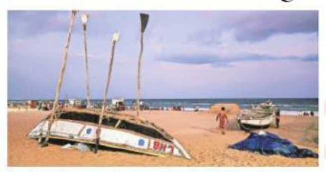
Anchored boats on the shore after the IMD issued an alert for coastal states regarding Cyclone Asani, in Puri, Sunday.

According to the 5.30pm observations of the IMD, the storm had intensified into the 'severe' category after moving at a speed of 14 km per hour. It was located