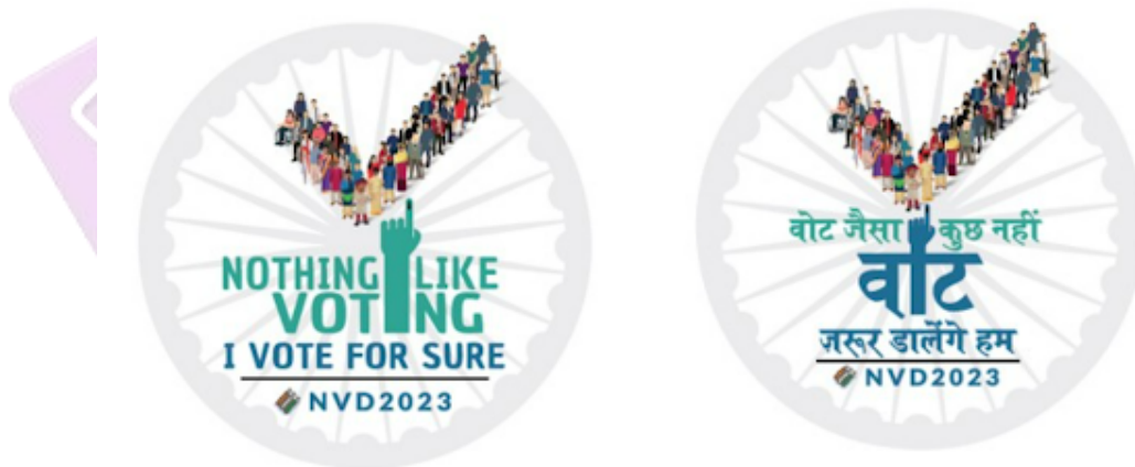
Figure: Logo of National Voter Day