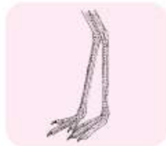
To walk on the land