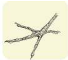
To hold the tree branches