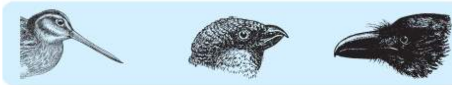
To find insects and worms from mud and shallow water