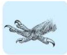
To catch the prey (what it hunts)