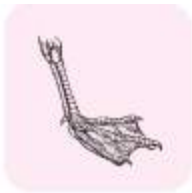
To swim in water