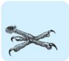
To climb the tree