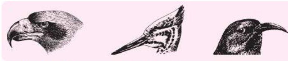
To tear and eat meat