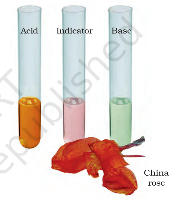
Fig. 4.3 China rose flower and indicator prepared from it