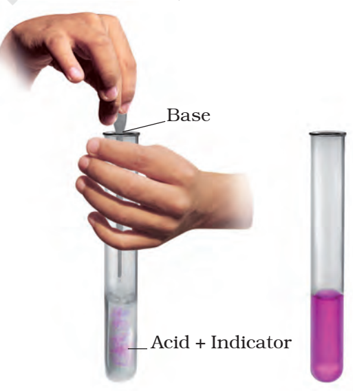
Fig. 4.4 Process of neutralisation

It is evident that when the solution is basic, phenolphthalein gives a pink colour. On the other hand, when the solution is acidic, it remains colourless.