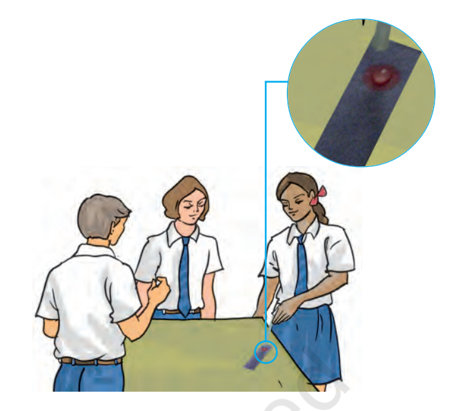
Fig. 4.2 Children performing litmus test

The solutions which do not change the colour of either red or blue litmus are known as neutral solutions. These substances are neither acidic nor basic.