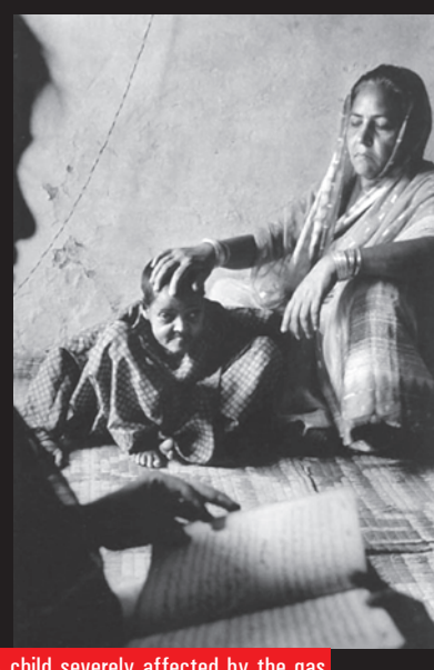
A child severely affected by the gas

Most of those exposed to the poison gas came from poor, working-class families, of which nearly 50,000 people are today too sick to work. Among those who survived, many developed severe respiratory disorders, eye problems and other disorders. Children developed peculiar abnormalities, like the girl in the photo.