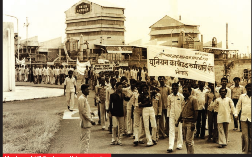
Members of UC Employees Union protesting

The disaster was not an accident. UC had deliberately ignored the essential safety measures in order to cut costs. Much before the Bhopal disaster, there had been incidents of gas leak killing a worker and injuring several.