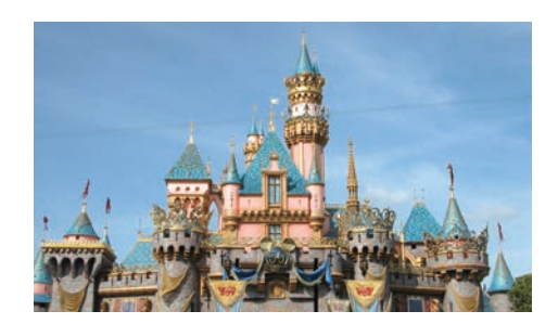
Recently a large travel agency was asked to pay Rs 8 lakh as compensation to a group of tourists. Their foreign trip was poorly managed and they missed Disneyland and shopping in Paris. Why did the victims of Bhopal gas tragedy then get so little for a lifetime of misery and pain?

Can you point to a few other situations where laws (or rules) exist but people do not follow them because of poor enforcement? (For example, over-speeding by motorists, not wearing helmet/seat belt and use of mobile phone while driving). What are the problems in enforcement? Can you suggest some ways in which enforcement can be improved?