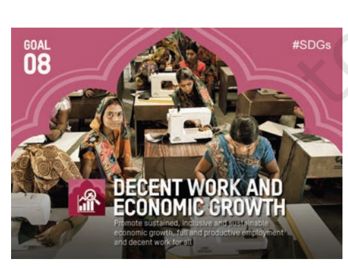
Sustainable Development Goal (SDG) www.in.undp.org

Ship-breaking is another hazardous industry that is growing rapidly in South Asia. Old ships no longer in use, are sent to ship-yards in Bangladesh and India for scrapping. These ships contain potentially dangerous and harmful substances. This photo shows workers breaking down a ship in Alang, Gujarat.