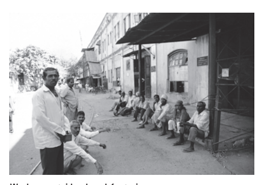
Workers outside closed factories. Thrown out of work, many of the workers end up as small traders or as daily-wage labourers. Some might find work in even smaller production units, where the conditions of work are even more exploitative and the enforcement of laws weaker.

Emissions from vehicles are a major cause of environmental pollution. In a series of rulings (1998 onwards), the Supreme Court had ordered all public transport vehicles using diesel were to switch to Compressed Natural Gas (CNG). As a result of this move, air pollution in cities like Delhi came down considerably. But a recent report by the Center for Science and Environment, New Delhi, shows the presence of high levels of toxic substance in the air. This is due to emissions from cars run on diesel (rather than petrol) and a sharp increase in the number of cars on the road.