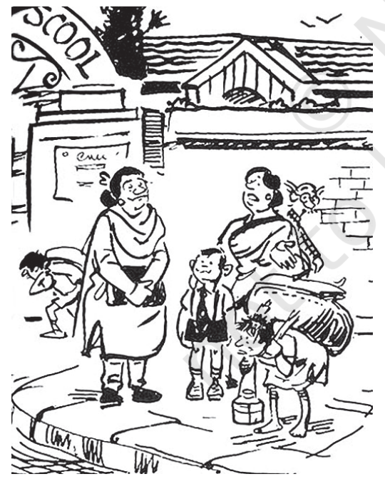
It's really cruel burdening kids like this. I had to hire that boy to help my son!

10. What do you think the famous cartoonist R.K. Laxman is trying to convey in this cartoon? How does it relate to the 2016 law that you read about on page 103?