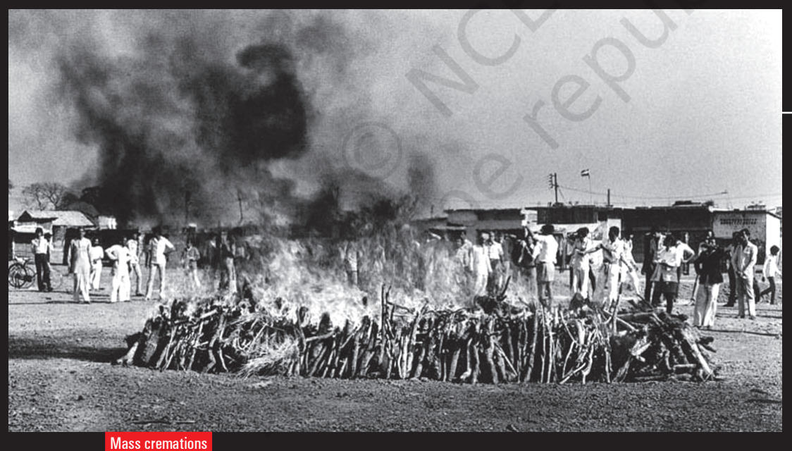
Within three days, more than 8,000 people were dead. Hundreds of thousands were maimed.

Most of those exposed to the poison gas came from poor, working-class families, of which nearly 50,000 people are today too sick to work. Among those who survived, many developed severe respiratory disorders, eye problems and other disorders. Children developed peculiar abnormalities, like the girl in the photo.