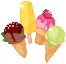
Ice cream party